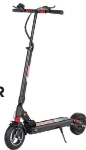
ZERO 8 ELECTRIC SCOOTER $999.99 - $1,199.99