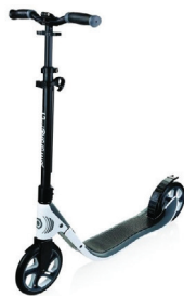
GLOBBER ONE NL 205 SCOOTER $339.99