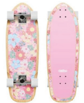
OBFIVE CHERRY BLOSSOM 28 CRUISER SKATEBOARD COMPLETE $189.99