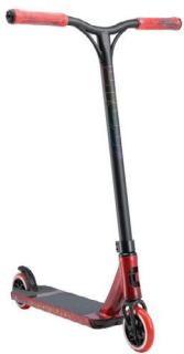
ENVY COLT S5 SCOOTER $239.99