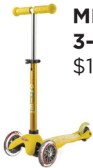
MICRO MIN DELUXE 3-WHEEL SCOOTER $169.99

Open since 2018, My Scooter Lab has built a reputation as the go-to shop for quality products, parts selection and great customer service on the Gold Coast.