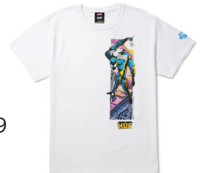
HUF X SPIDER-MAN WEB OF WHITE TEE $69.99